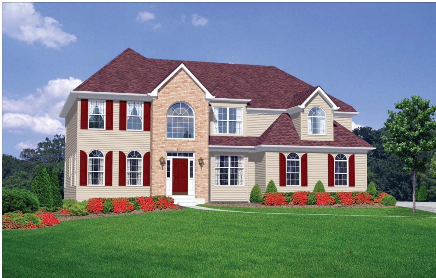
THE GLADWYNE ESTATE