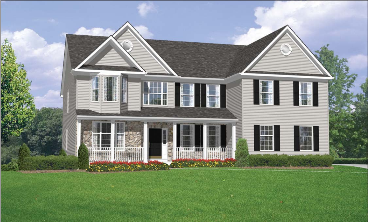
THE GATSBY HERITAGE