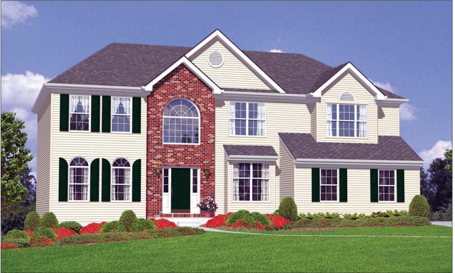
THE CLASSIC CORNERSTONE