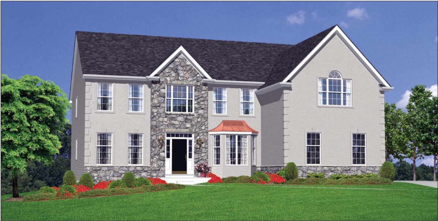
THE CENTURY HERITAGE